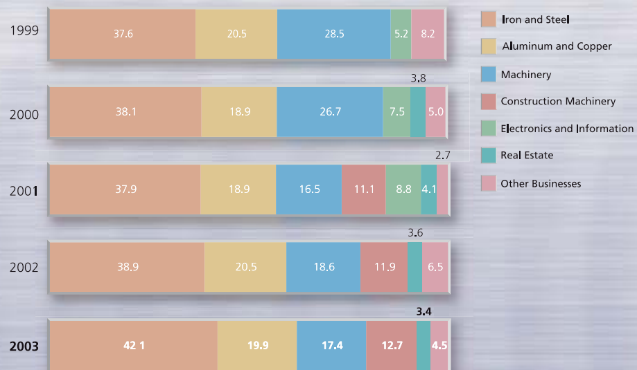
Segment Sales (%)

Notes : These figures include inter-segment sales.