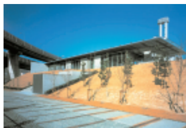
Exterior of Nadahama Science Square

The Nadahama Science Square, together with the adjacent health and fitness center and tennis club, provide a perfect venue for local residents and the Company staff to mingle.