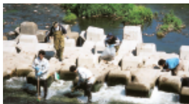
Removing litter from the Kinugawa River

The staff at our plants help to keep the local environment clean by participating in regular neighborhood cleanups. Other social service initiatives are also pursued to ensure that the Company contributes to the welfare of the local communities within which it operates.