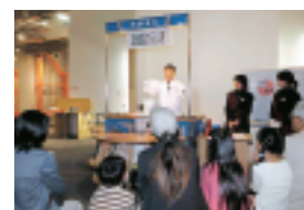
Interactive programs where visitors can enjoy the wonders of science and technology