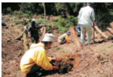
Woodland preservation activities

We recognize that, in the struggle to preserve the global environment, many initiatives are required that will go beyond the resources of the Kobe Steel Group, and that activities by the general public are also important. For these purposes, we intend to support those activities through donations.