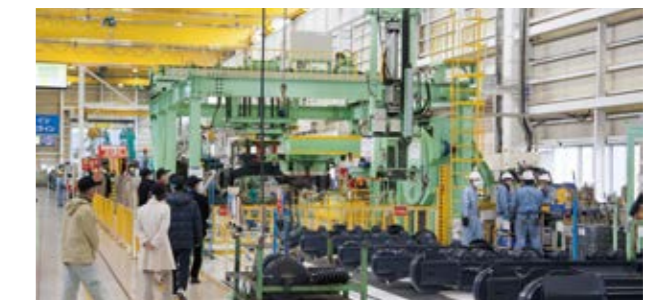
(Top) Kakogawa Works, (bottom) Kobelco Construction Machinery's Itsukaichi Factory