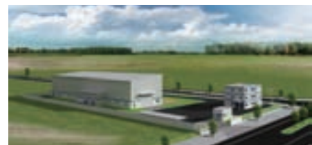
Conception drawing of completed Long Duc Plant in Vietnam