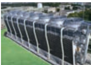
Plume abatement cooling towers

Local production will enable us to respond to the increased demand for glass-lined equipment in Southeast Asia and to supply Japan. Under the slogan "Japanese quality from Vietnam," the new plant will contribute to the development of Japan and Southeast Asia's pharmaceutical, fine chemical and electronic materials fields.