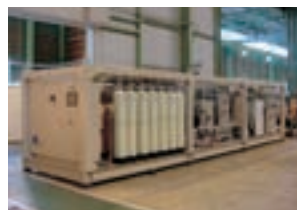
Water electrolysis high-purity hydrogen oxygen generator