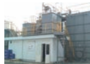
Water treatment systems delivered by KESV