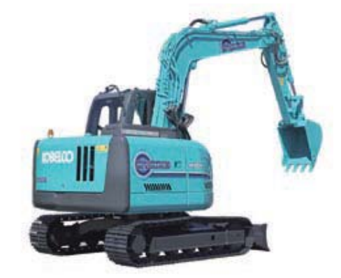
SK80 hybrid hydraulic excavator

The rebuilt Qingxing Shengang Primary School Kobelco Construction Machinery aids in Chengdu City's reconstruction.