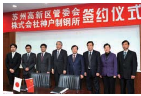
Kobe Steel decided to establish the new company in Suzhou New District, Suzhou, Jiangsu Province to address anticipated growth in the Chinese market

The three companies previously established Kobe Aluminum Automotive Products, LLC (KAAP) in the U.S. state of Kentucky. Since 2005, KAAP has been meeting the demand needs of automobile makers in North America. Anticipating growing demand in China, Kobe Steel came to the conclusion that a production base within that country was essential.