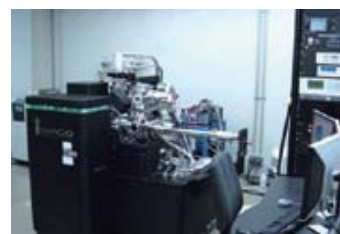
Three-dimensional atom probe

We will leverage this new analysis method to propose the use of new materials to automakers and to increase the performance of steel and other materials.