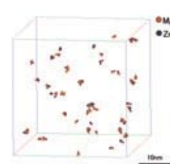
Cluster mapping of magnesium and zinc