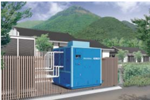
Illustration of Microbinary power generation system to be installed at Yufuin Shoya no Yakata Hot Spring

The SteamStar®, our compact steam-powered generator, is another technology developed for harnessing untapped energy sources and effectively using steam. Small boilers used in small-to medium-sized manufacturing facilities have been unable to completely use the low-pressure energy from steam generated during the manufacturing process. By harnessing this untapped steam energy, SteamStar® makes highly efficient power generation possible. In Japan, there are nearly 250,000 small boilers. If SteamStar® was installed at only 10% of those boiler sites, Japan could conserve electricity and reduce annual CO 2 emissions by five million tons.