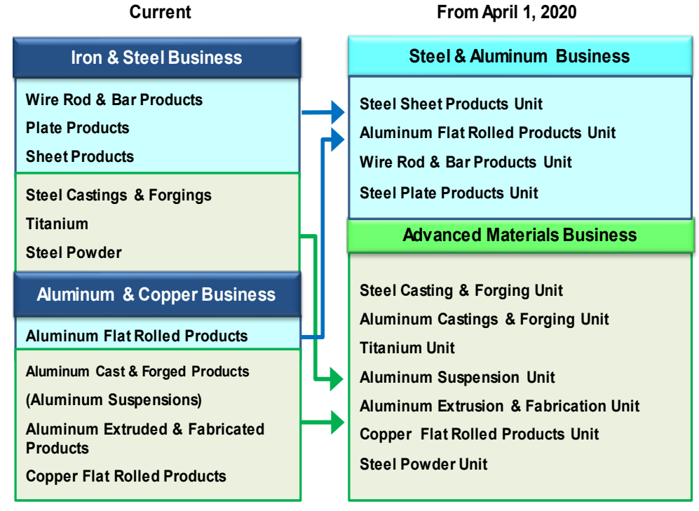
Fig. 1 Reorganization with a focus on materials and parts