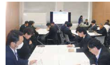
Study session on environmental laws and regulations

In fiscal 2019, study sessions on environmental laws and regulations were held three times and training sessions for persons in charge of waste management were held four times. A total of 133 people took part in these study and training sessions.