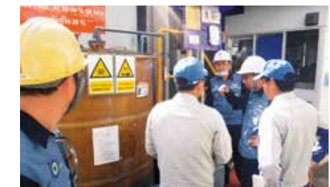
On-site environmental audit at Thai-Kobe Welding Co., Ltd.