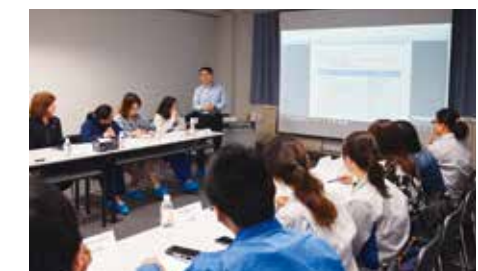
Networking event in China

In the United States and China, employees in charge of environmental management participate in environmental seminars and networking events in order to advance the skills of environmental managers at Group companies and share information on the latest developments in environment-related laws and regulations. Employees who will be transferred to overseas locations are given environmental training prior to their departure with the aim of heightening the consciousness of environmental risks, raising the awareness of local laws and regulations, and preventing environmental problems.