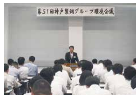
KOBELCO Group Environmental Meeting

The KOBELCO Group Environmental Meeting is held every year for the purposes of sharing environmental information and promoting cross-development of environmental initiatives. In fiscal 2019, participants shared useful examples of ways to reduce environmental burden at the business locations where they work and reviewed changes to environmental laws and regulations.