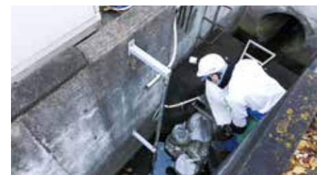
Drill on setting out sandbags and oil absorbent mats in preparation for leakages (Shinko North Co., Ltd.)

Each business location periodically conducts drills for possible emergency situations. Issues are identified in follow-up meetings after the drills and steps are taken to improve responsiveness.