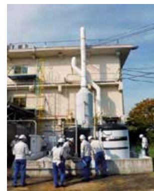
On-site environmental audit (Ibaraki Plant)

On-site environmental audits: 6 business locations of Kobe Steel, 12 business locations of 8 domestic Group companies