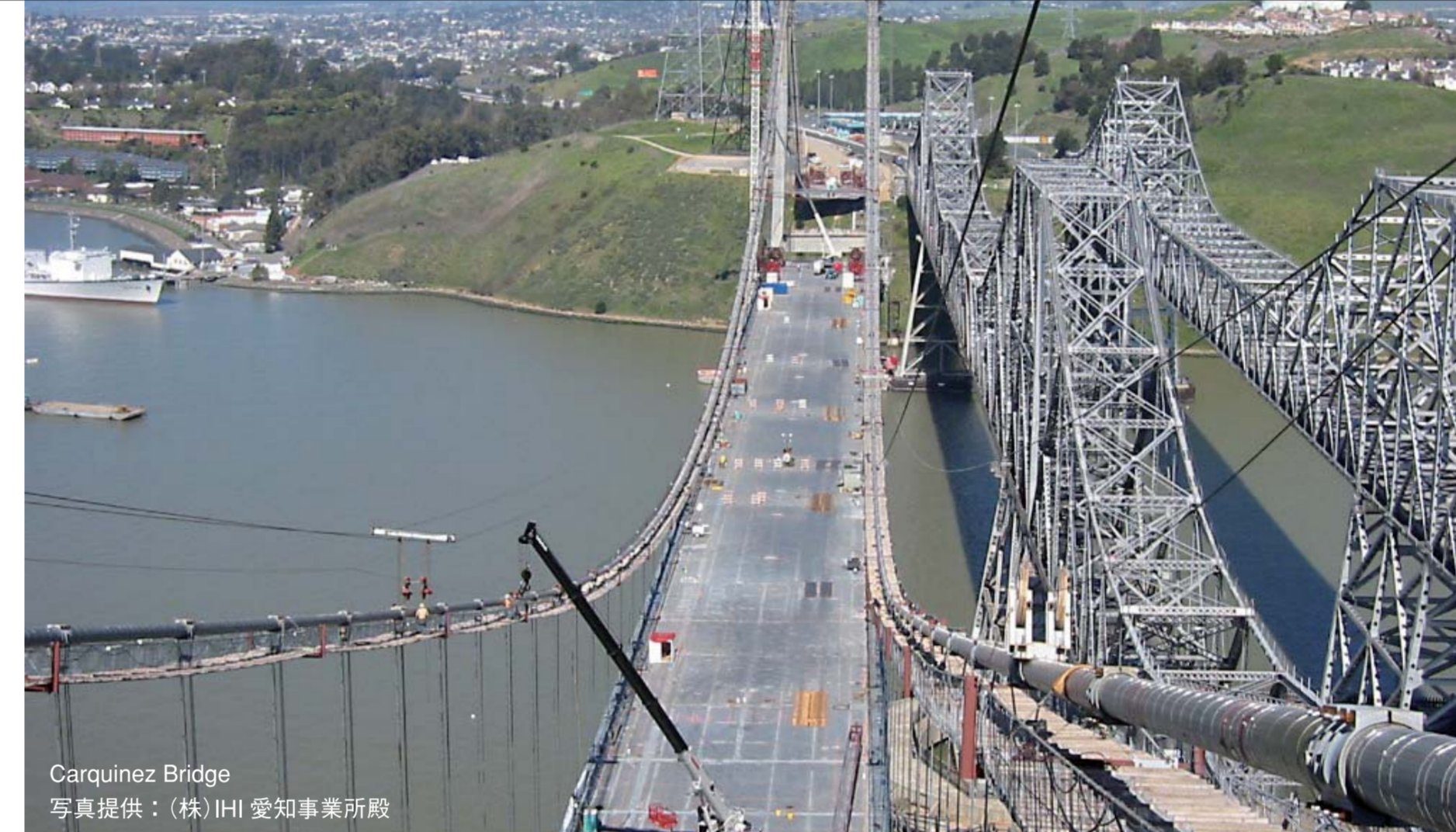
Carquinez Bridge