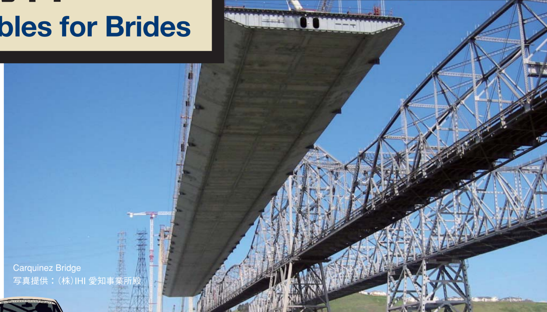
Carquinez Bridge