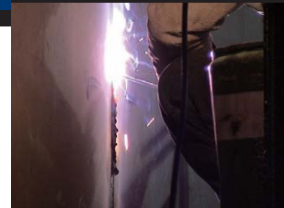
PREMIARC NI-C70S PREMIARC NI-C1S