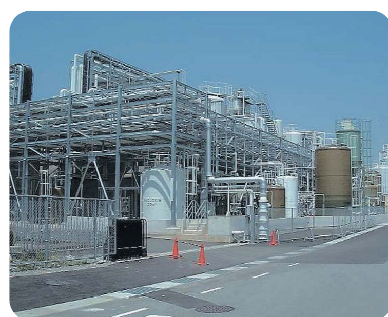
Natural Resources and Engineering Business