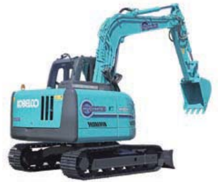
SK80 hybrid hydraulic excavator

In January 2010, sales commenced of the 8-ton class SK80 hybrid hydraulic excavator, which uses 40% less fuel than conventional models. An urban-use construction machine, the SK80 Hybrid is anticipated to perform well in residential areas. In addition to lower fuel consumption and CO 2 emissions, the SK80 Hybrid realizes unparalleled low-noise operations. Kobelco Construction Machinery will continue to produce people- and environment-friendly construction machinery in the years to come.