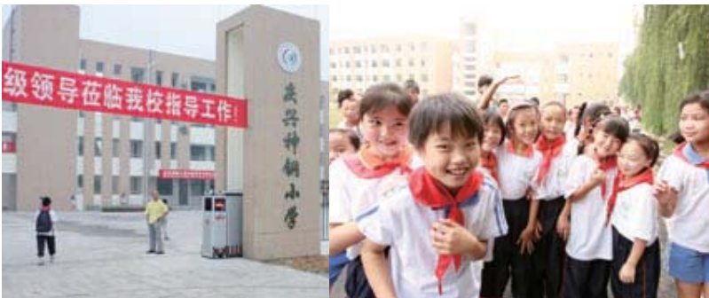
The rebuilt Qingxing Shengang Primary School Kobelco Construction Machinery aids in Chengdu City's reconstruction.

Three companies—Kobelco Construction Machinery Co., Ltd. and its joint ventures in China, Chengdu Kobelco Construction Machinery Group Co., Ltd. and Chengdu Kobelco Construction Machinery Co., Ltd.—undertook the rebuilding of an elementary school that collapsed in China's Great Sichuan Earthquake of May 2008. Completed in September 2009, the school is now attended by smiling pupils. Reflecting Chinese government policy, the Chinese characters for "Kobe Steel" have been included in the school's name. Exchanges between the school and the three companies will extend far into the future.