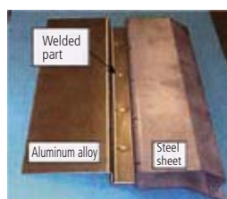
Example of aluminum alloy-steel weld

This area of research is at a stage that has established fundamental joining techniques, and MRL will be pushing ahead with the development necessary for its application to actual components.