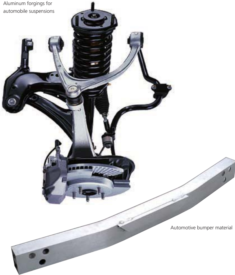
Automotive bumper material