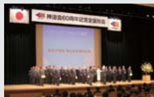
Shinyokai's 60th Anniversary

Shinyokai, our sales organization for welding consumables, celebrated its 60th anniversary in 2011. Shinyokai's efforts for over 60 years has guided and supported Japan's industrial development and monozukuri-ryoku . As this year marks the first year since the Great East Japan Earthquake, we ran a commemorative sales campaign under the slogan of "Fight! Tohoku." A total of ¥25 million, a portion of the proceeds from this campaign, has been donated as relief funds to the Center for Vocational Training of Elderly and Disabled Job Seekers.