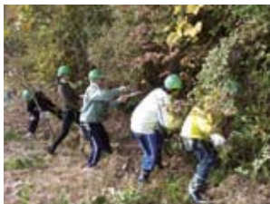
Forest conservation activities kickoff (November 2011)

* ECOWAY is a symbol of the Kobe Steel Group.