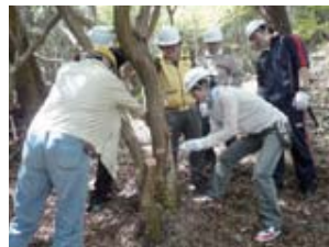
Forest conservation work kickoff (April 2012)