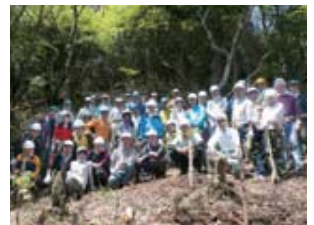
Forest opening (April 2012)