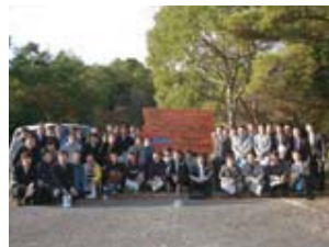
Forest opening (November 2011)