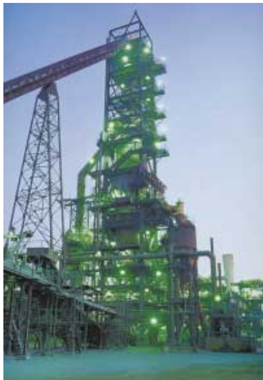
Direct-reduction iron-making plant

Recently we have developed a new iron making