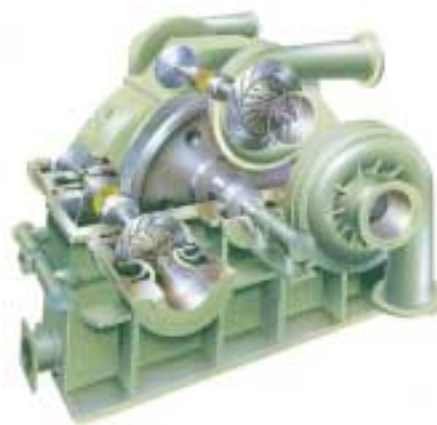
Integrally geared type compressor