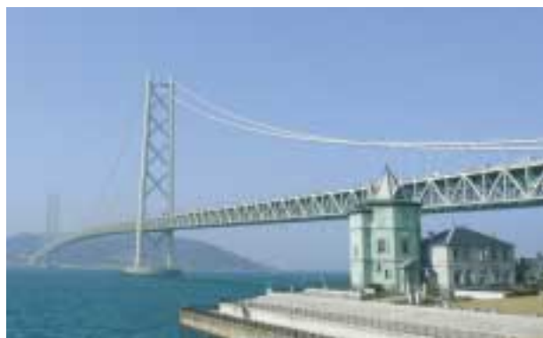
Akashi Strait Bridge

Our R&D activity played an important role in supporting the business activities described above and we have constantly improved our R&D framework. Our research laboratory started in 1932 as an analysis group in the inspection department,