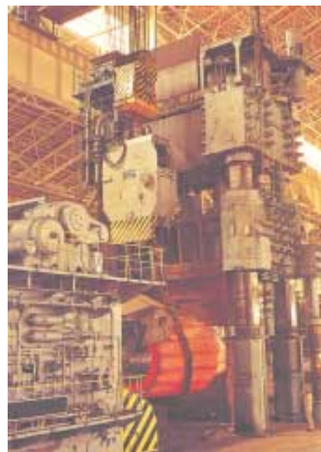
8000t forging press

In the 1960s the Japanese steel manufacturing industry was becoming the supply base of the world with its annual crude steel production approaching 100 million tons. To meet growing demand for steel, we inaugurated the Kakogawa Works and blew-in the No.1 blast furnace there in