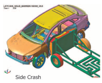
Fig.2 Simulation result of deformation of vehicle under side impact

Fig.1 Mg and Si atoms found to be aggregated in an AI-Mg-Si alloy after (a) 10.8ks, (b) 360ks natural aging