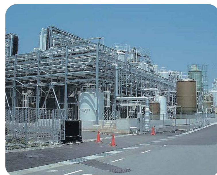
Natural Resources and Engineering Business