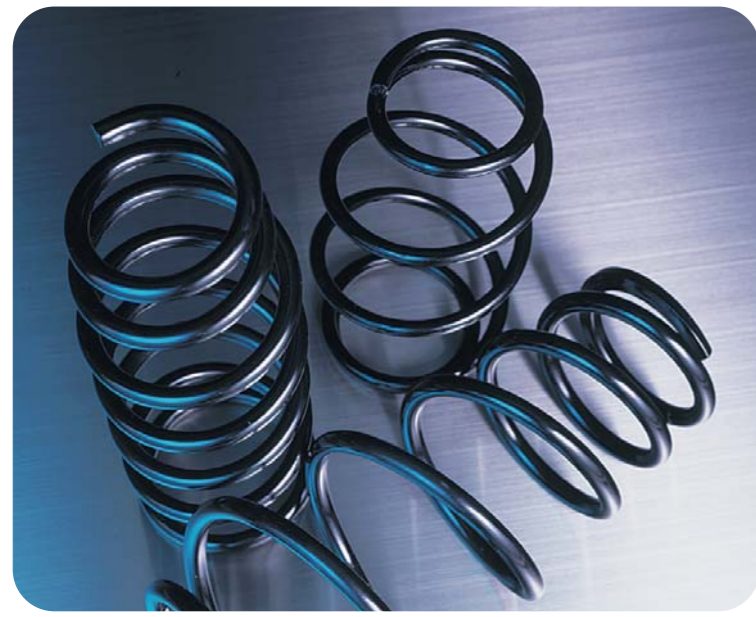
Iron and Steel Business

The Kobe Steel Group operates in a wide range of fields that provide the very foundation of society, including both the materials sector and the machinery sector. Our mission is to contribute to society through the creation of new value using our comprehensive manufacturing capabilities.