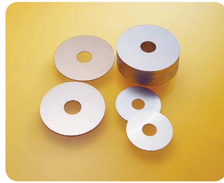
Aluminum and Copper Business